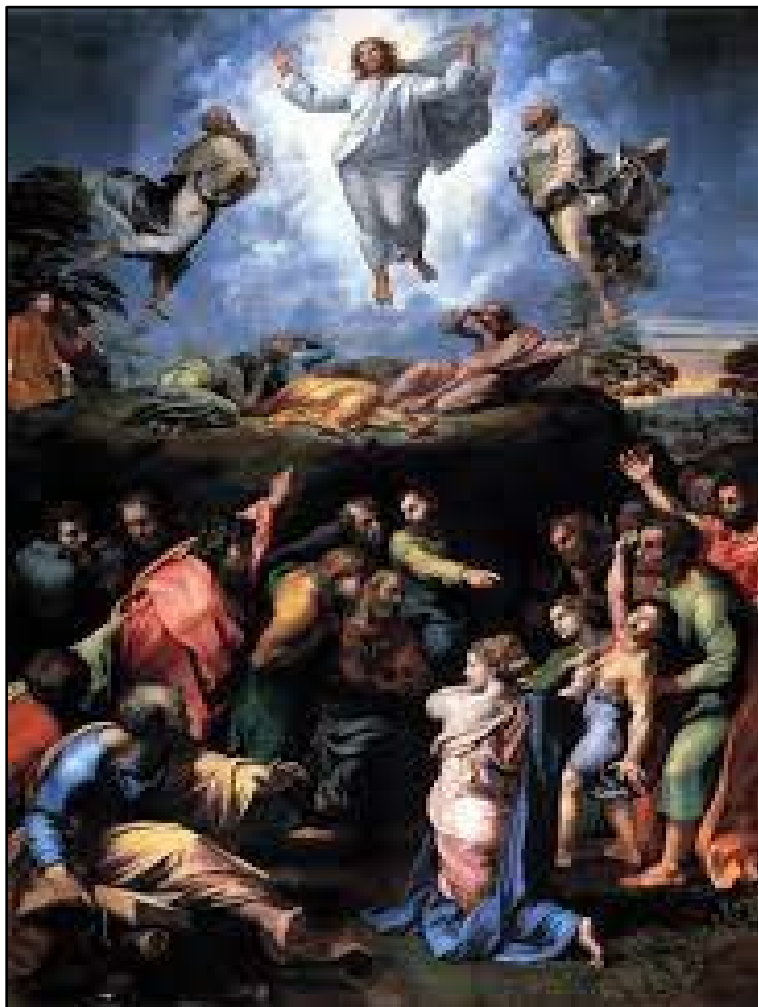
The Transfiguration by Raphael , c. 1520