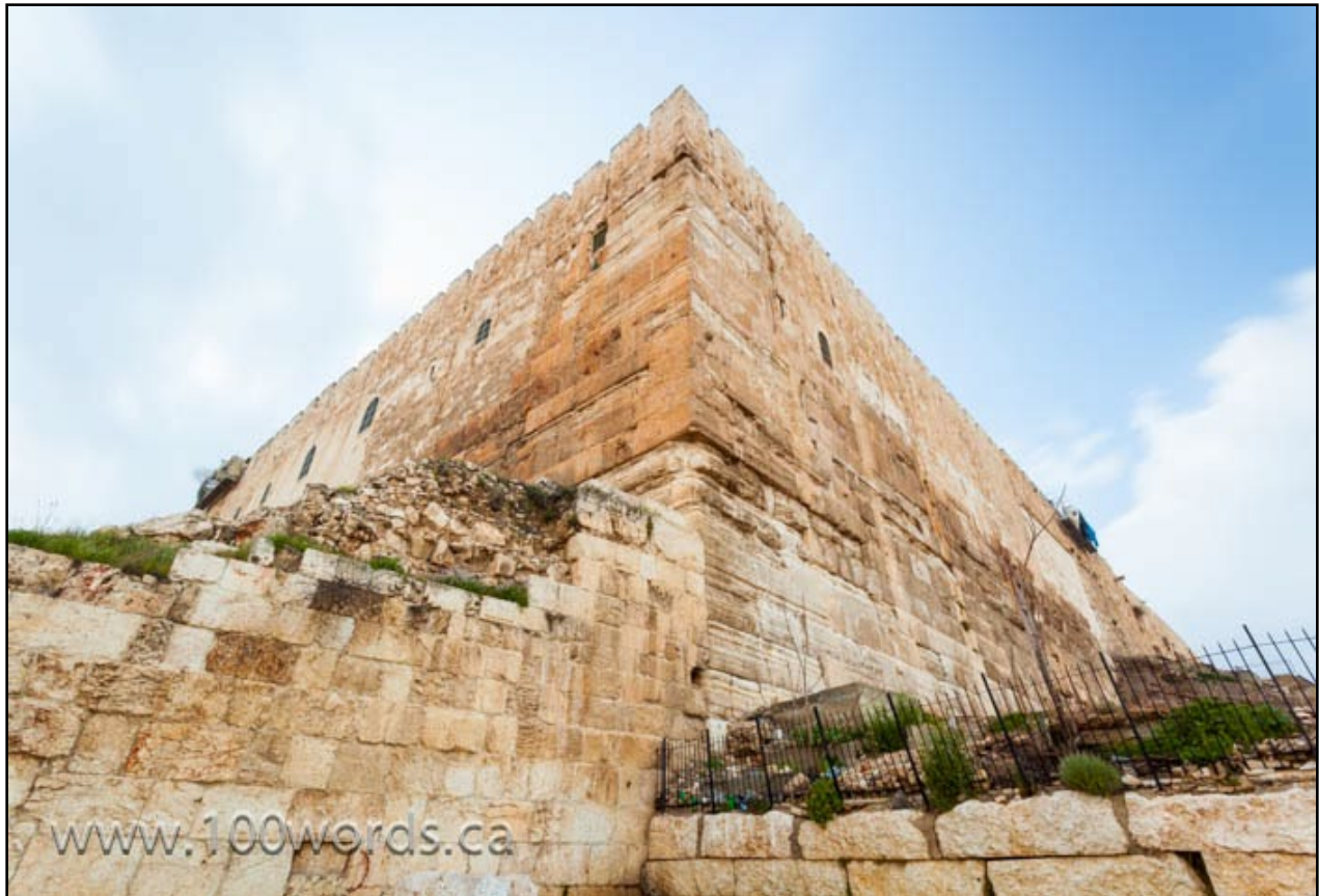
The Pinnacle of the Second Temple http://www.100words.ca/

Year One The First Sunday of Lent: Daily Office BCP P.952 Copyright license #253227