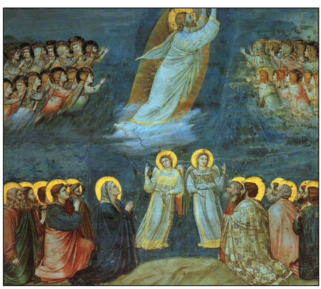
The Ascension Giotto ublic Domain, 1410