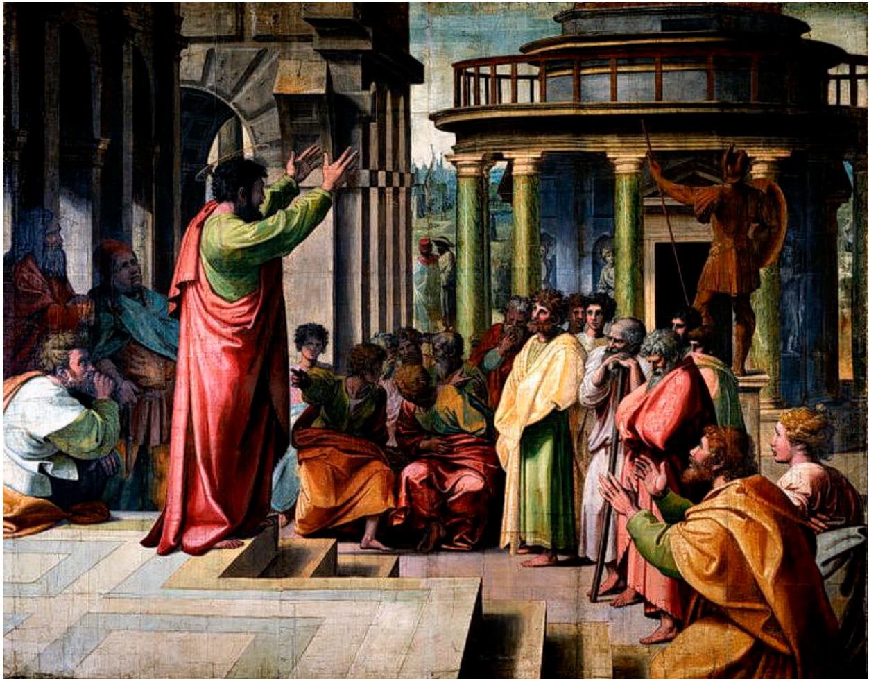
Saint Paul delivering the Areopagus Sermon in Athens, by Raphael, 1515.