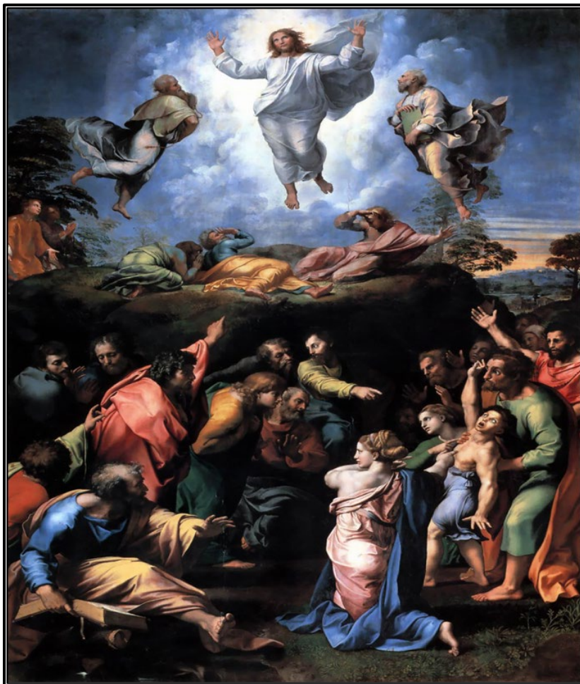
The Transfiguration, Raphael, 1516-1520, Pinocoteca Vaticana, Rome