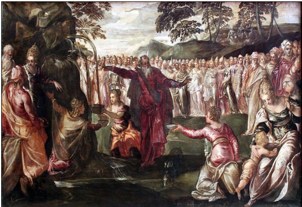
Moses Striking the Rock Jacopo Tintoretto (1519-1594) The Stadel, Frankfurt, Germany