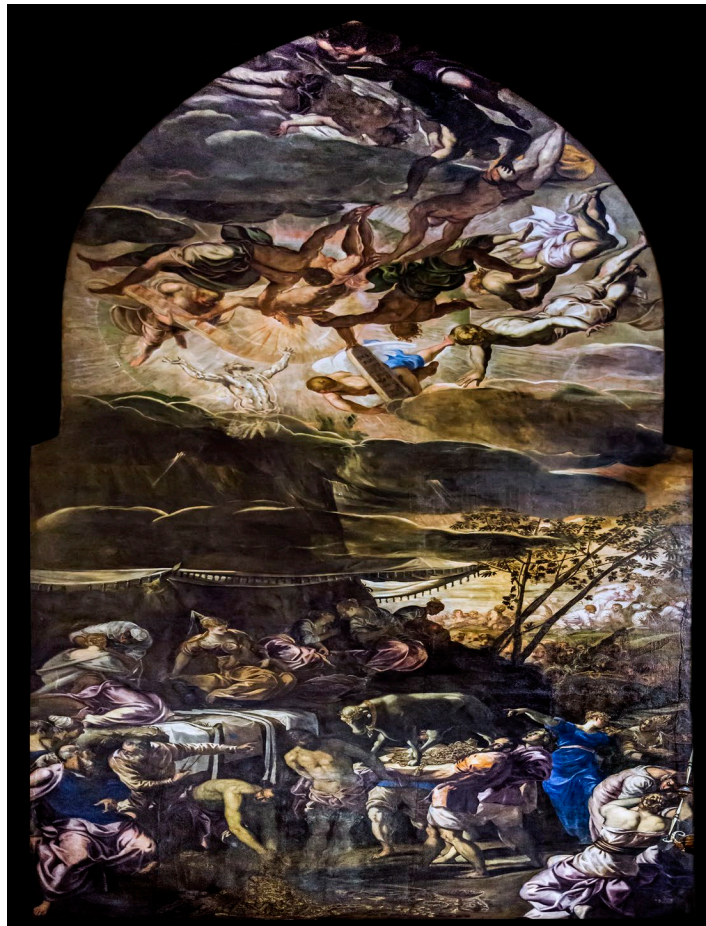
The Worship of the Golden Calf Jacopo Tintoretto (1519-1594) Madonna del'Orto, Venice