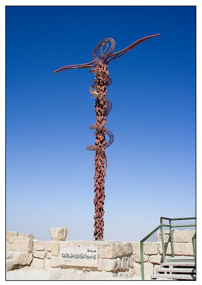
Brazen Serpent Sculpture Atop Mount Nebo