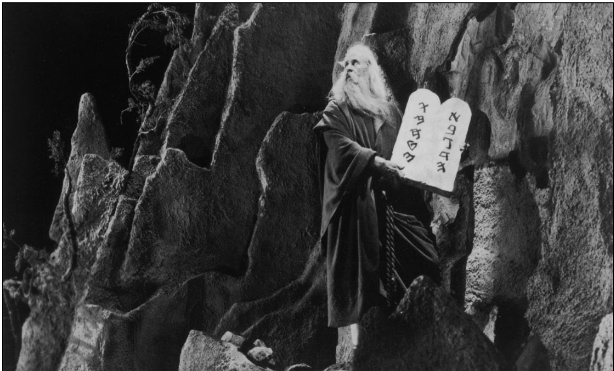
American actor Theodore Roberts as Moses in Cecil B. DeMille's silent version of The Ten Commandments, 1923