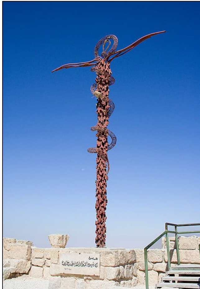
Brazen Serpent Sculpture Atop Mount Nebo