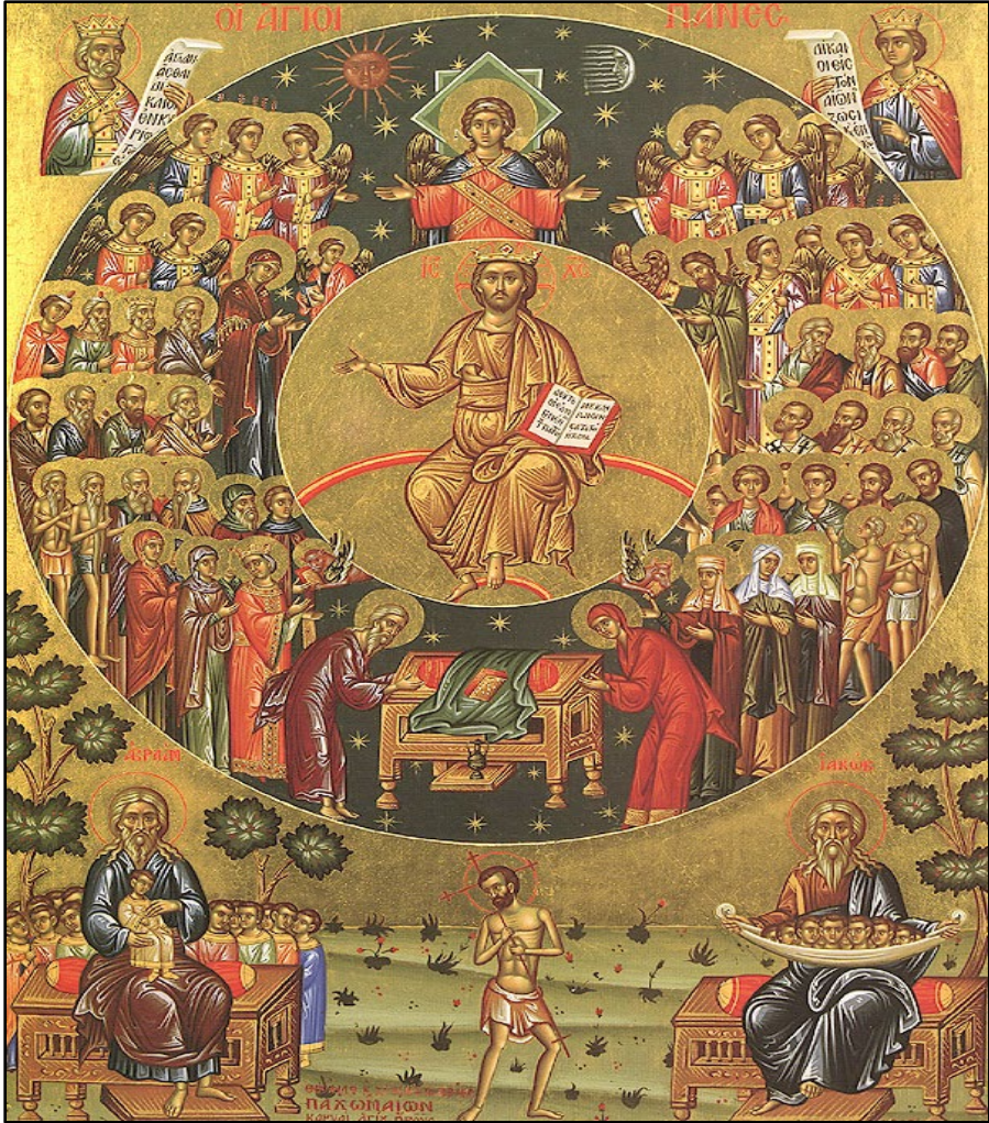
Orthodox icon of All Saint