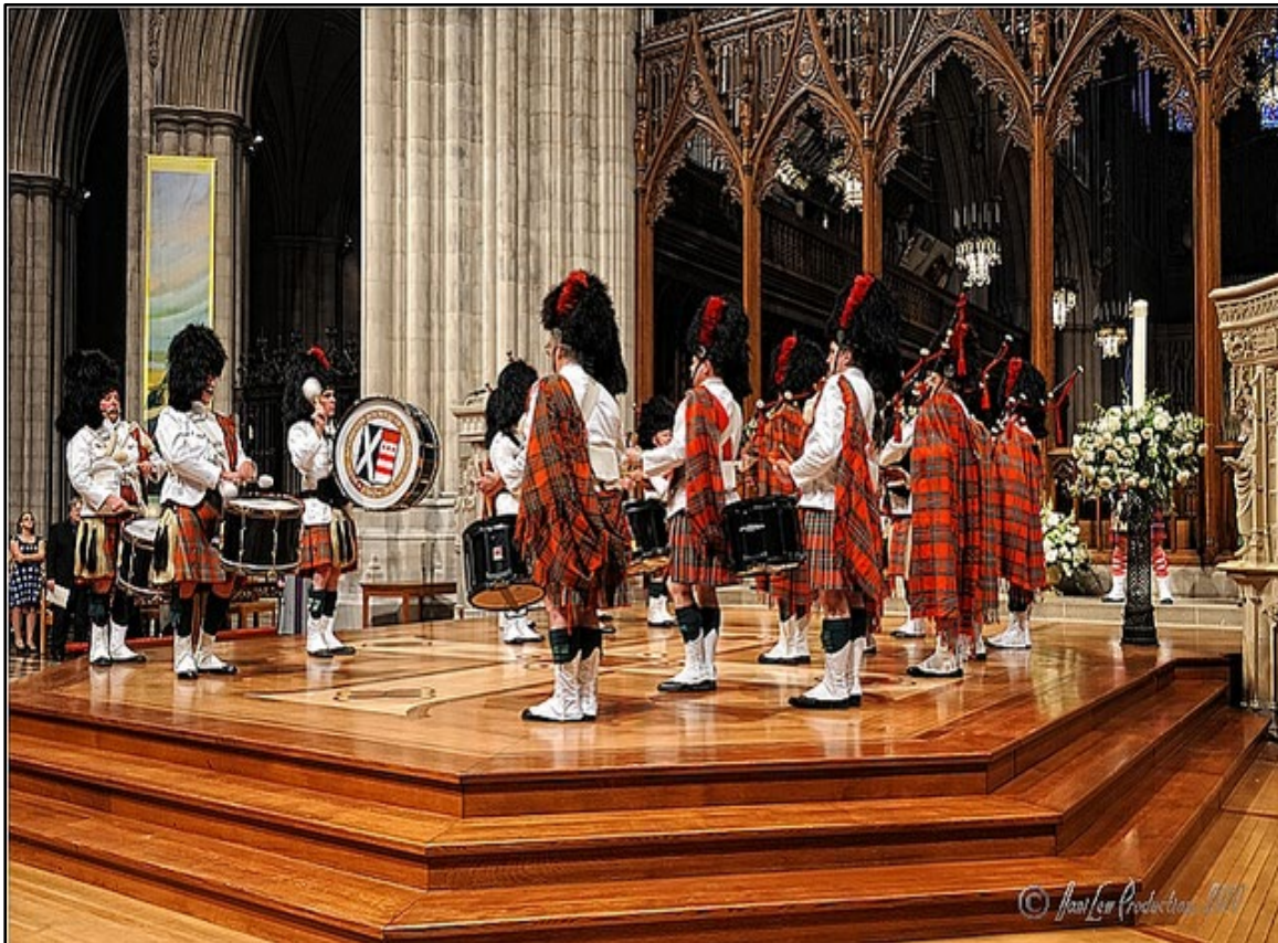
Tartan Kirkin of the National Cathedral