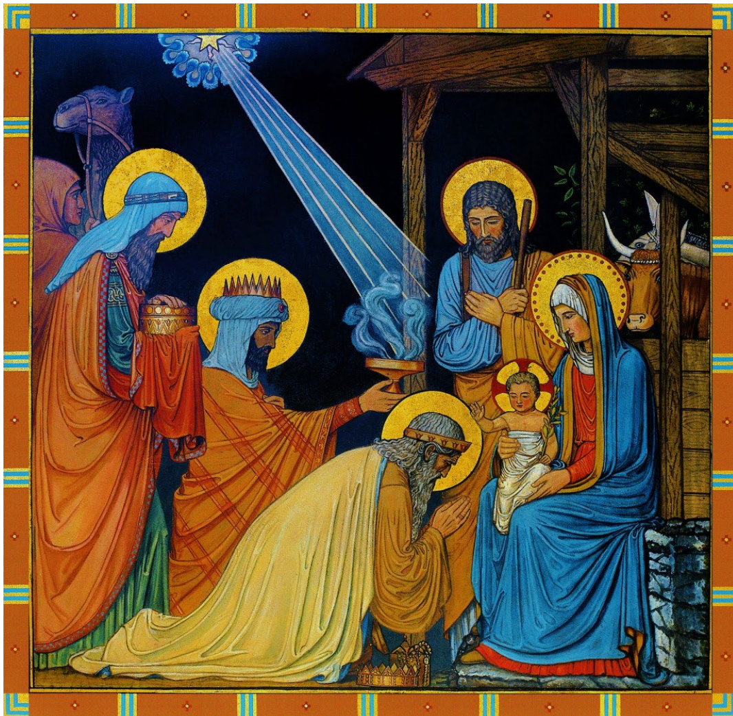
Adoration of the Magi