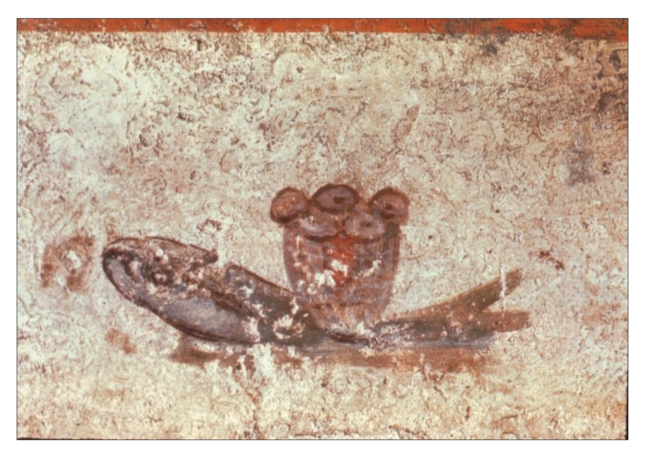
The Eucharistic Fish and Bread Catacombe di San Callisto di Roma, courtesy of Wikipedia Commons