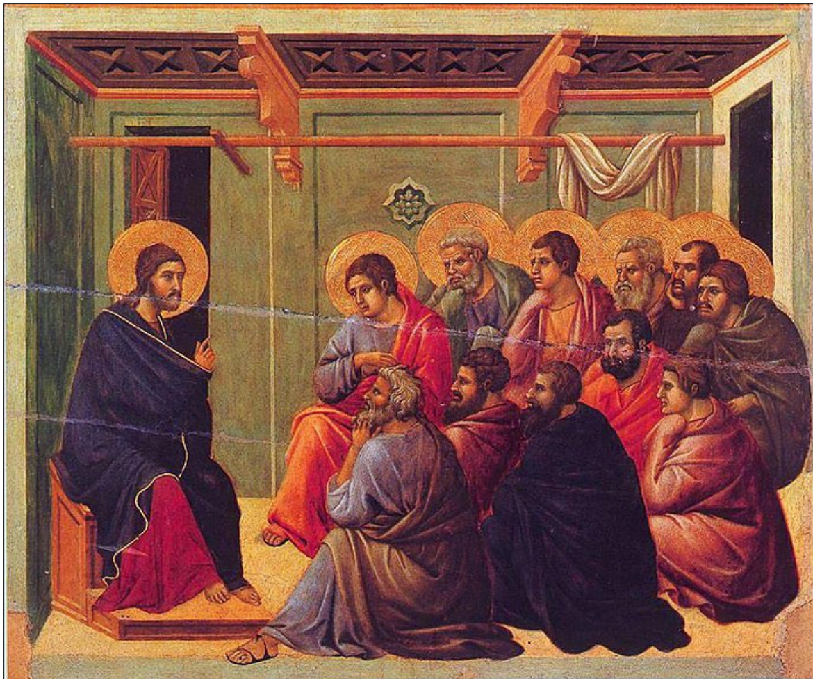
Christ Taking Leave of the Apostles (1308-1311 AD) Duccio di Buoninsegna (1255-1319 AD) Museo dell'Opera metropolitana del Duomo, Siena, Italia