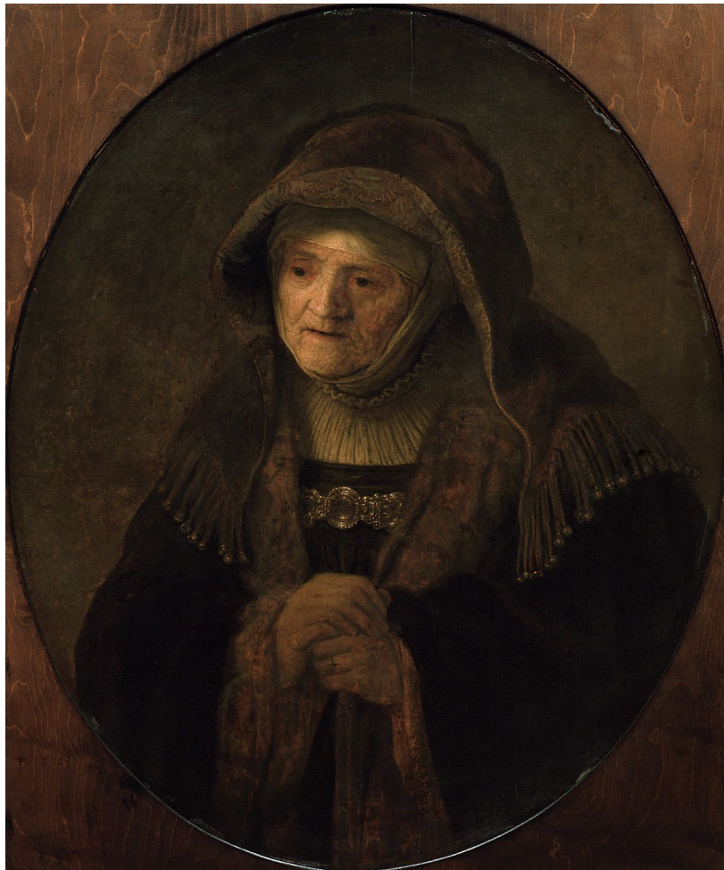
Portrait of an Old Woman (the Prophetess Hannah), 1639 Rembrandt Harmensz van Rijn (1606-1669) Kunsthistorisches Museum Wien, Vienna