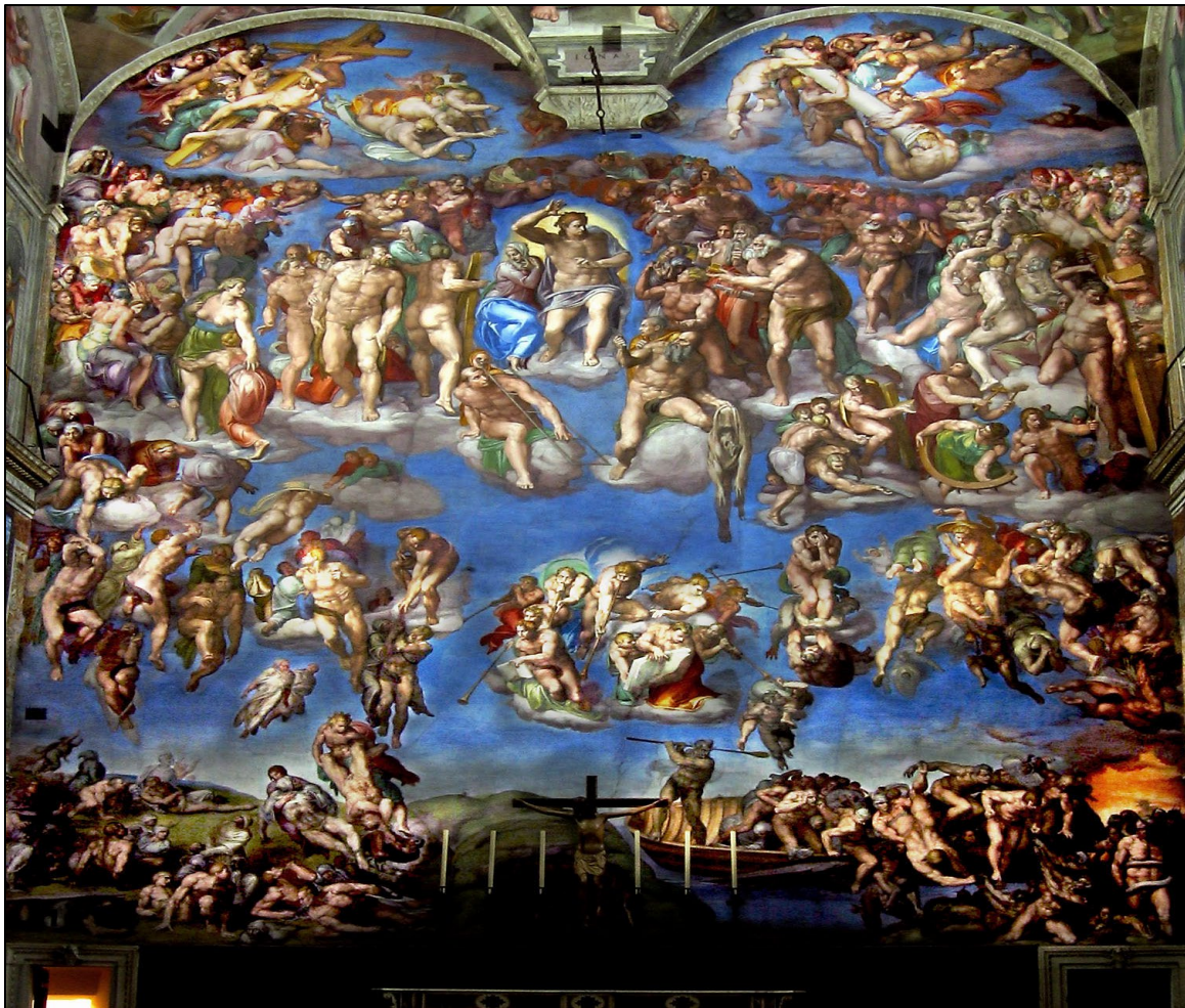
The Last Judgment (1536-1541)

Michelangelo (1475-1564), Cappella Sixtina, Vatican City