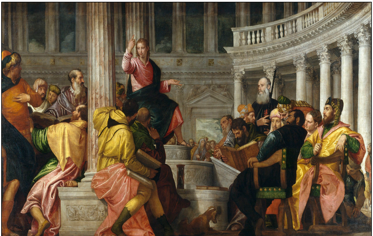
Jesus Among the Doctors, 1560 Paolo Veronese (1528-1588) Museo del Prado

http://www.museodelprado.es/typo3temp/pics/2ce71c7a65.jpg