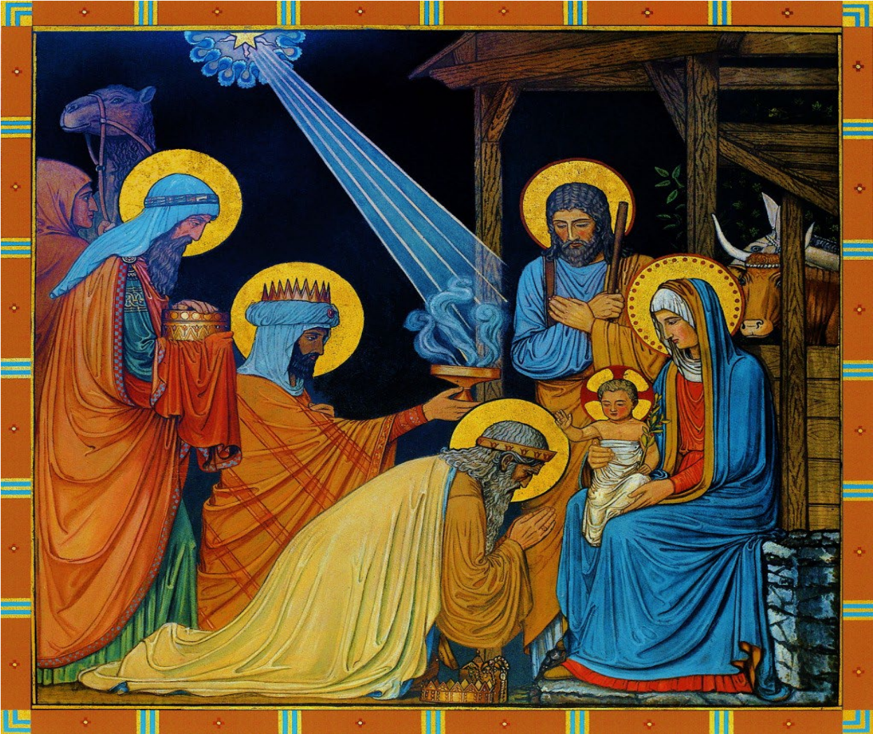
Adoration of the Magi