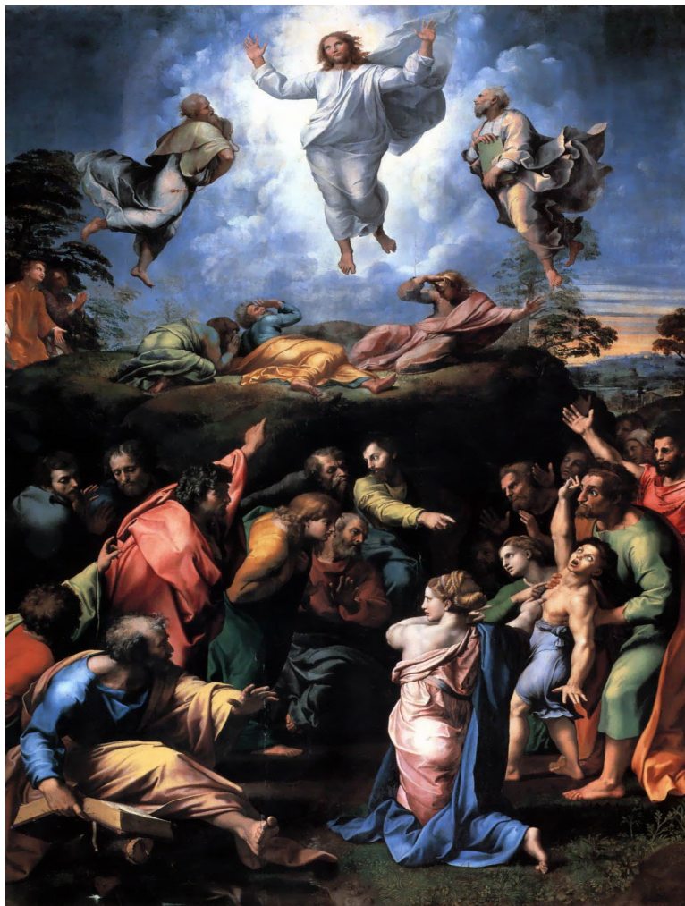
Raphael's Transfiguration, 1516-1520

https://commons.wikimedia.org/wiki/File:Transfiguration_Raphael.jpg