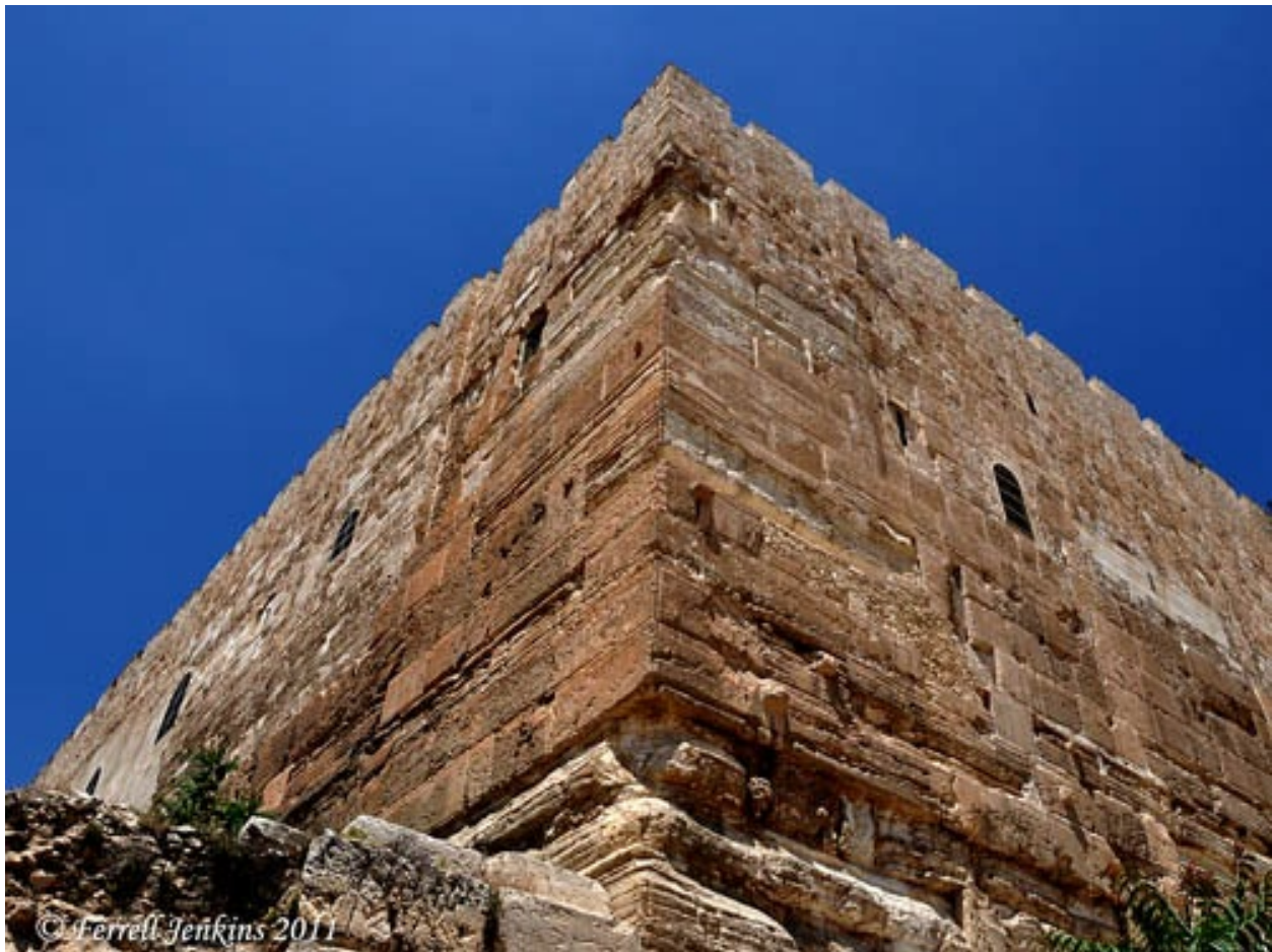
Pinnacle of the Temple Ferrell Jenkins, 2011