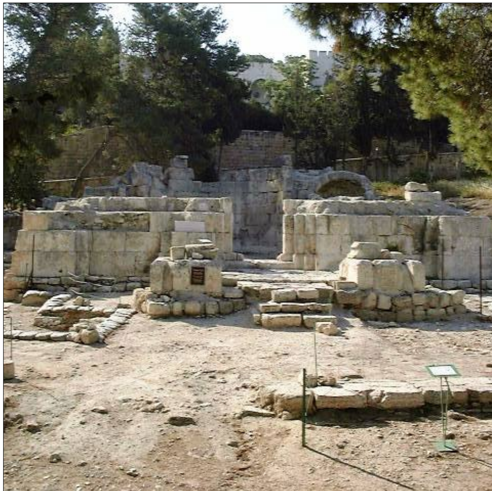
The Byzantine Basilica of Emmaus Nicopolis (5th–7th cent.), restored by Crusaders during the 12th century

https://en.wikipedia.org/wiki/Emmaus#/media/File:Emmaus_Nicopolis_basilica.JPG