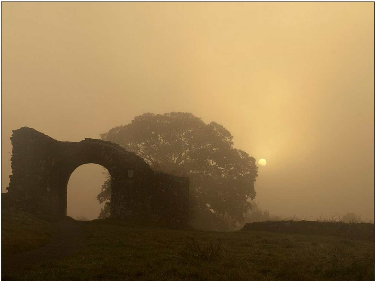
Sheepgate in Porchfield, Trim, Co. Meath, Ireland

https://commons.wikimedia.org/wiki/File:Sheep_Gate_sunrise_large_print.jpg