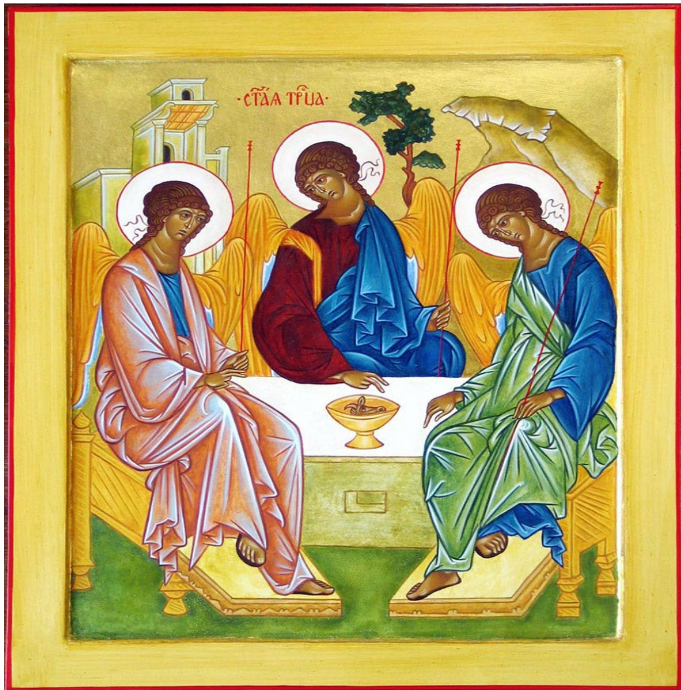
The Three Visitors to Abraham Andrei Rublev, 1410 Wikimedia Commons